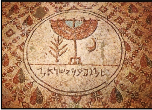
Mosaic from the floor of the ancient Shalom Al Yisrael Synagogue in Jericho